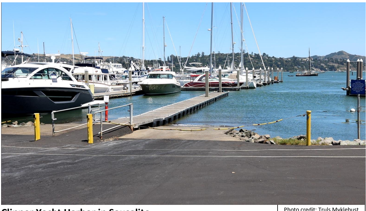
Clipper Yacht Harbor in Sausalito

Address: 310 Harbor Drive, Sausalito, CA 94965 Coordinates: 37.868627N, 122.497147W