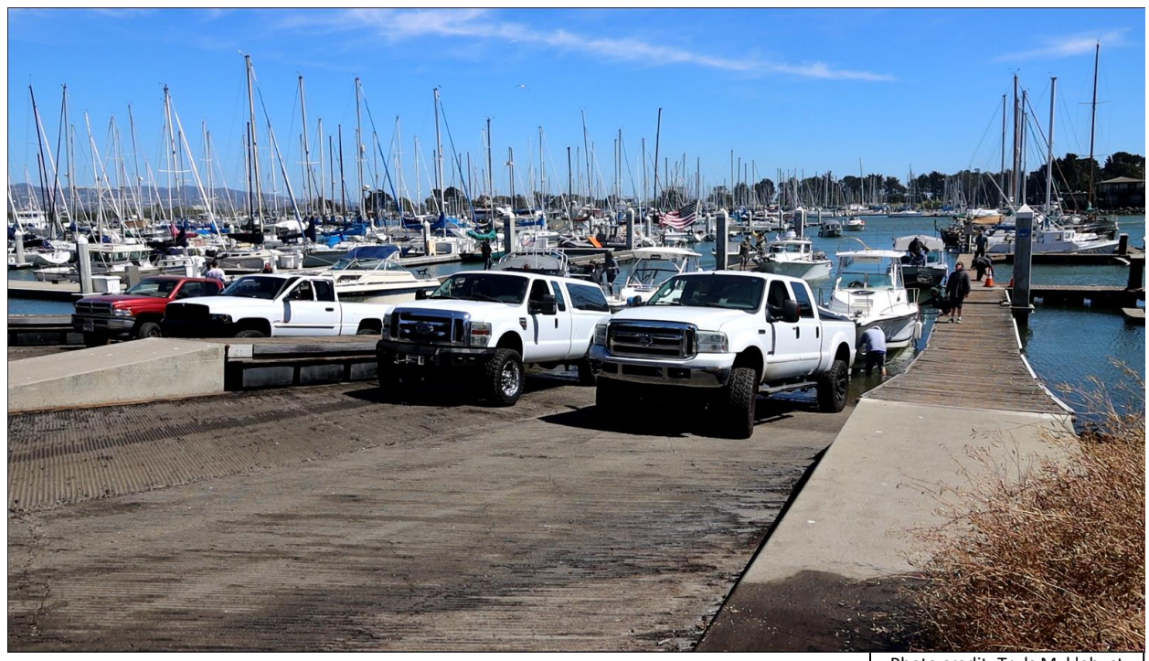
Berkeley Marina Boat Launch Ramps in Berkeley

Address: 1-1/2 Spinnaker Way, Berkeley, CA 94710