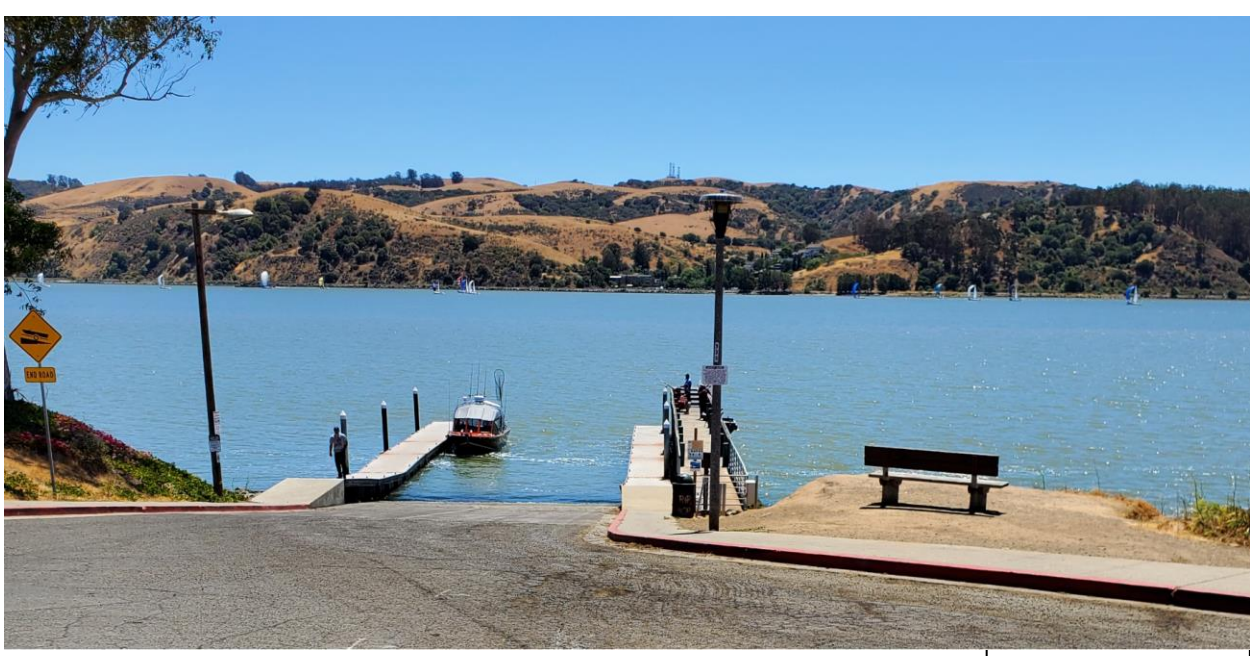
W 9th St. Boat Launch & Pier in Benicia

This launch ramp on the Mare Island Strait features two launch ramps with dock fingers, with lots of parking available. The launch ramps are behind a breakwater that protects the area from the currents that the Mare Island Strait are renowned for. This is not too far away from Vallejo Yacht Club, which is the destination for both the Great Vallejo Race and the SSS Vallejo I-II races. Mare Island Strait empties into Carquinez Strait and San Pablo Bay. Beware of ferry traffic, as there is a ferry terminal near the launch ramp.