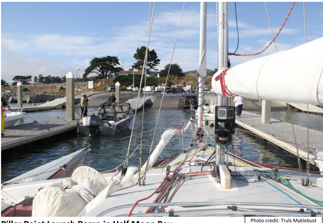
Pillar Point Launch Ramp in Half Moon Bay

Address: Pillar Point Harbor Blvd, Half Moon Bay, CA 94019