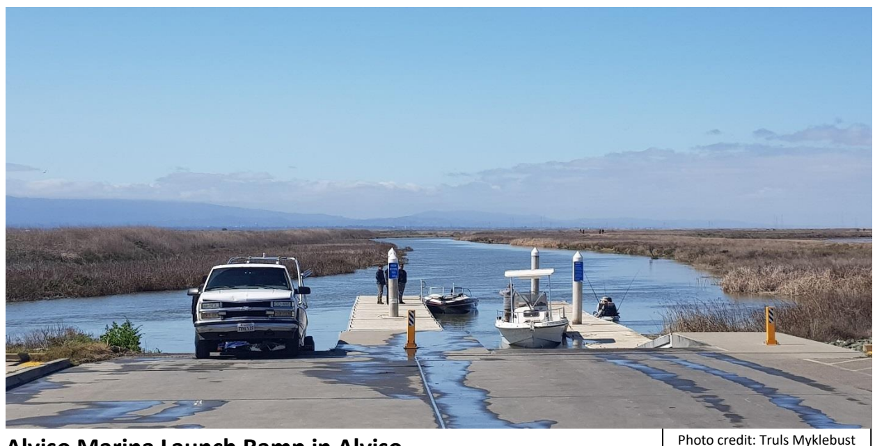
Alviso Marina Launch Ramp in Alviso

Address: 1195 Hope Street, Alviso, CA 95002 Coordinates: 37.429319N, 121.981893W