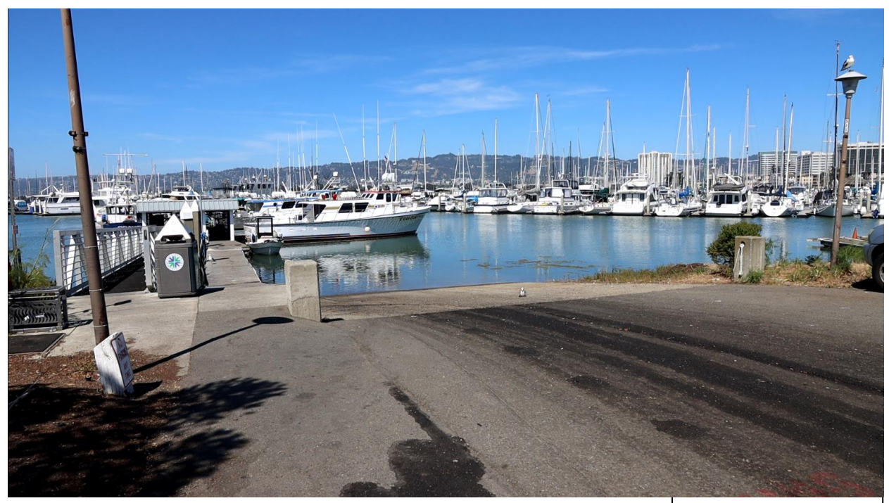
Emeryville Marina Sport Fishing Docks in Emeryville

Address: Powell Street, Emeryville, CA 94608 Coordinates: 37.838457N, 122.313028W