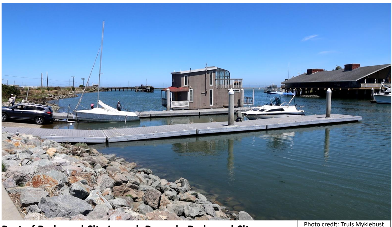
Port of Redwood City Launch Ramp in Redwood City

Address: 601 Chesapeake Drive, Redwood City, CA 94063