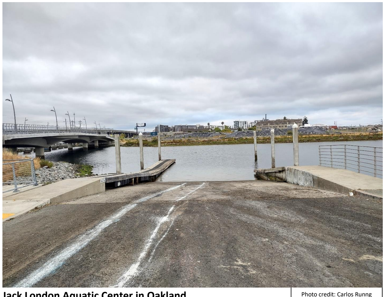
Jack London Aquatic Center in Oakland

Address: 115 Embarcadero, Oakland, CA 94607 Coordinates: 37.790810N, 122.264669W