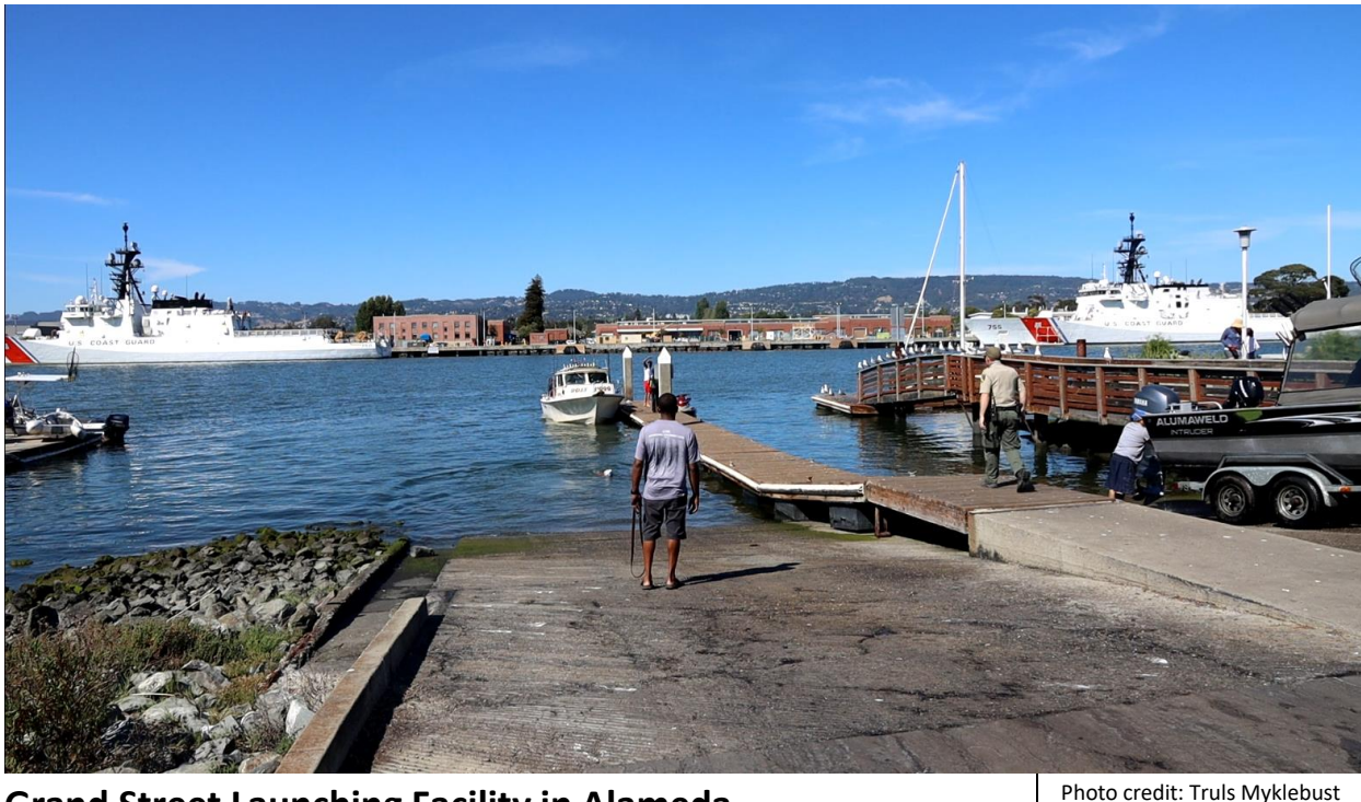
Grand Street Launching Facility in Alameda

There are lots of launch ramps in the Bay Area and the areas just beyond, each with pros and cons. If you're bringing your trailerable multihull to the Bay Area, here are the available launch ramps that are closest to the Central Bay. This article only covers launch ramps into the bay, the sea, or rivers or estuaries that are connected to the bay. No lakes are covered in the below.